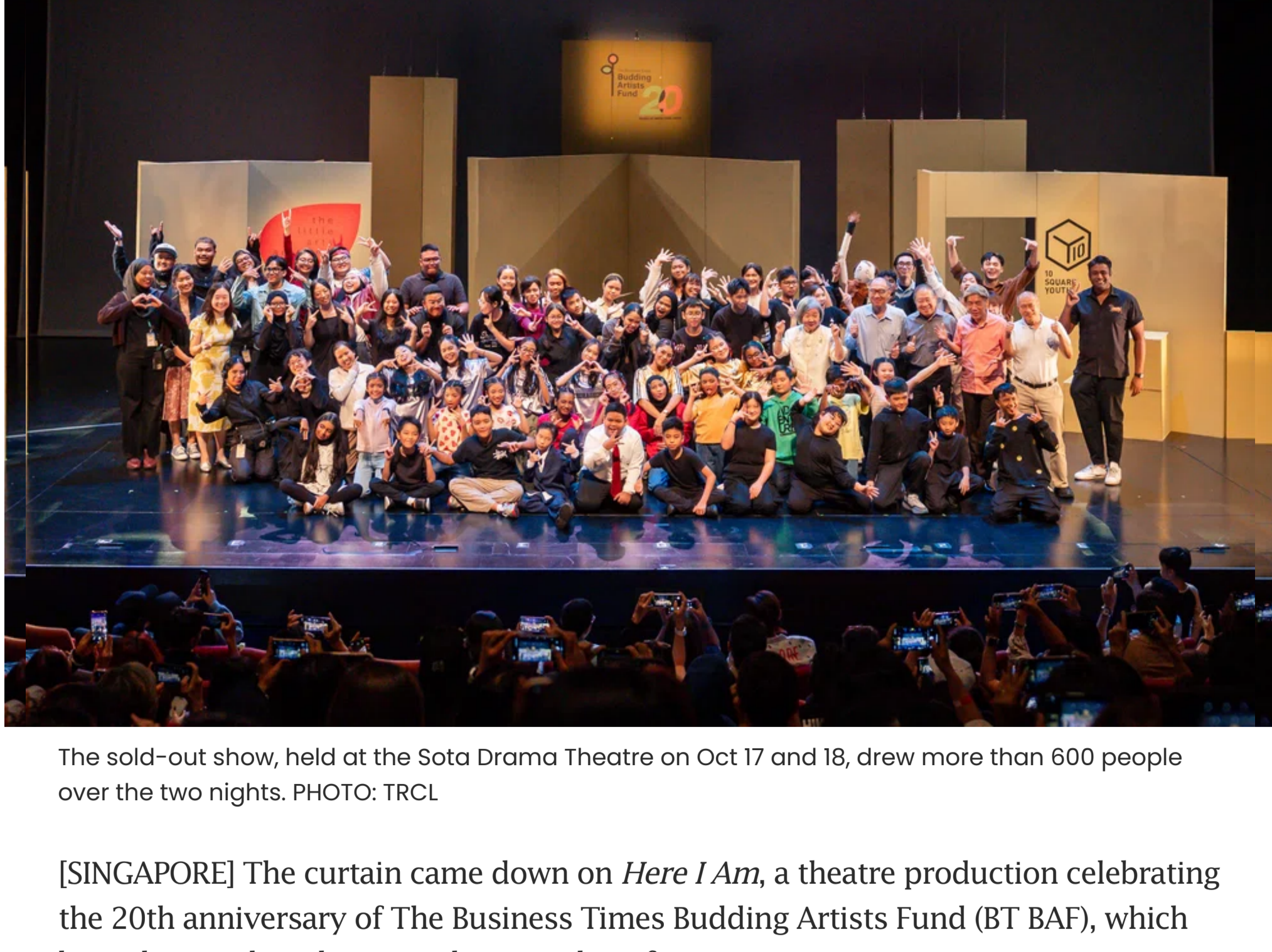
The sold-out show, held at the Sota Drama Theatre on Oct 17 and 18, drew more than 600 people over the two nights.

[SINGAPORE] The curtain came down on Here I Am , a theatre production celebrating the 20th anniversary of The Business Times Budding Artists Fund (BT BAF), which brought together alumni and current beneficiaries on stage.