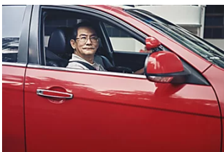
Figure Out How Much You Can Make as a GrabCar Driver